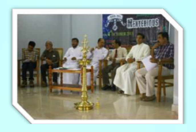
MEXTERIOUS 2K13 INAGURATION